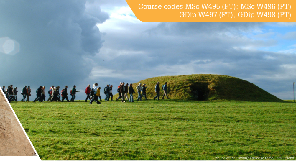
Mound of the Hostages passage tomb, Tara, Ireland