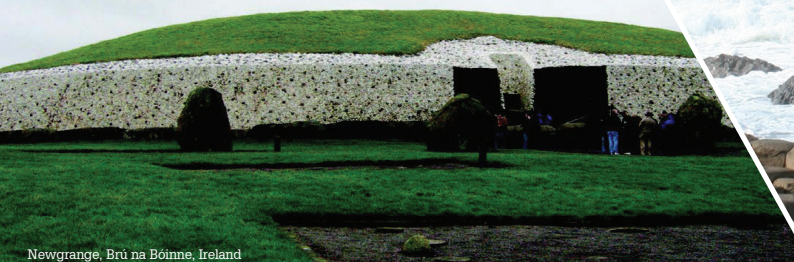
Newgrange, Brú na Bóinne, Ireland