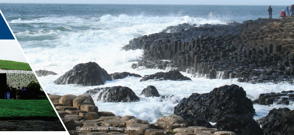
Giant's Causeway, Northern Ireland