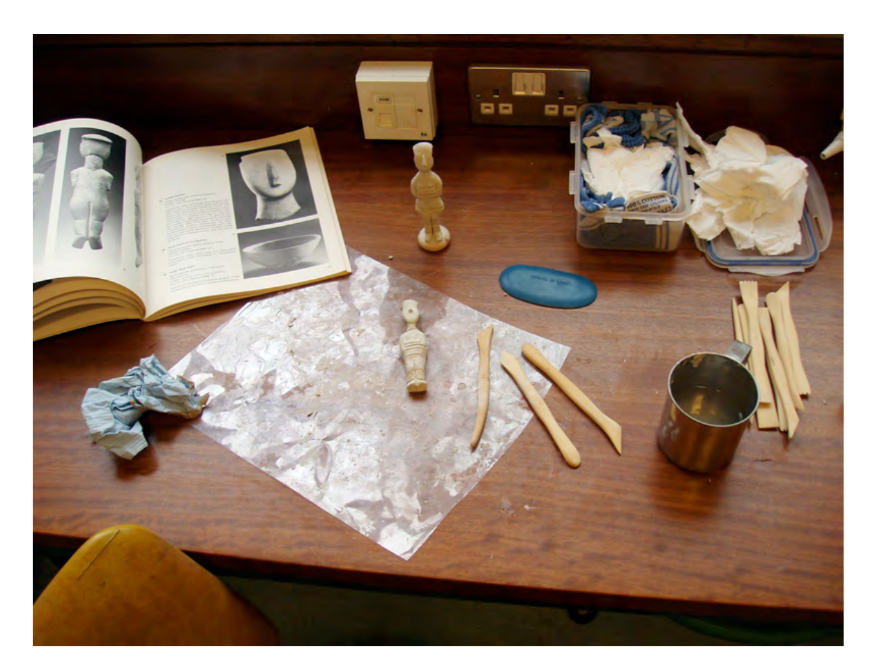
Research and development of a prototype for IRAC Interventions 2: Day of the Figurines, Theoretical Archaeology Group, York, England, 2007. <http://www.iarchitectures.com/irac2.html>