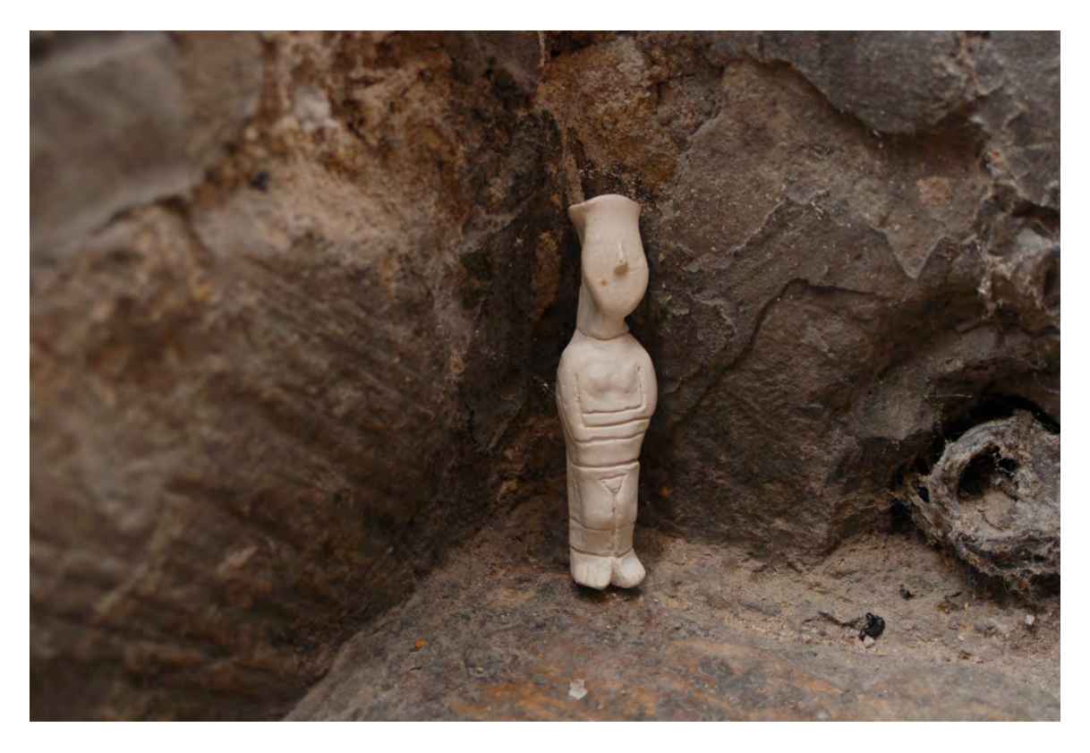
Documented deployment from IRAC Interventions 2: Day of the Figurines, Theoretical Archaeology Group, York, England, 2007. <a href="http://www.iarchitectures.com/irac2.html">http://www.iarchitectures.com/irac2.html</a>

Thus we call archaeologists to participate in active and dynamic methods of visual expression. We are not asserting the need for a Dadaist archaeology or a Futurist archaeology or a surrealist archaeology. What we call for is a re-engagement of