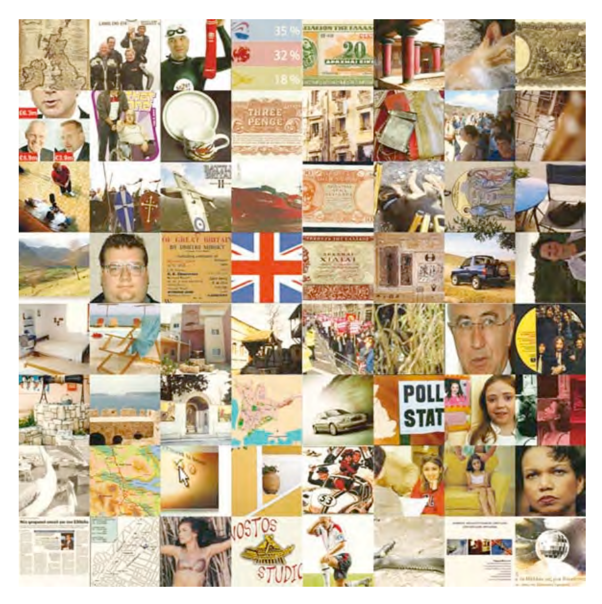
Detail of Reflexive Representations [1]. Each corner focuses on the images resulting from each search as follows: Upper Left - 'Britain' Bottom Left - 'Greece' Upper Right -'Elladda' and 'Ellas' Bottom Right - 'Bretania'. <http://www.iarchitectures.com/rrexhibit.html#rr1>