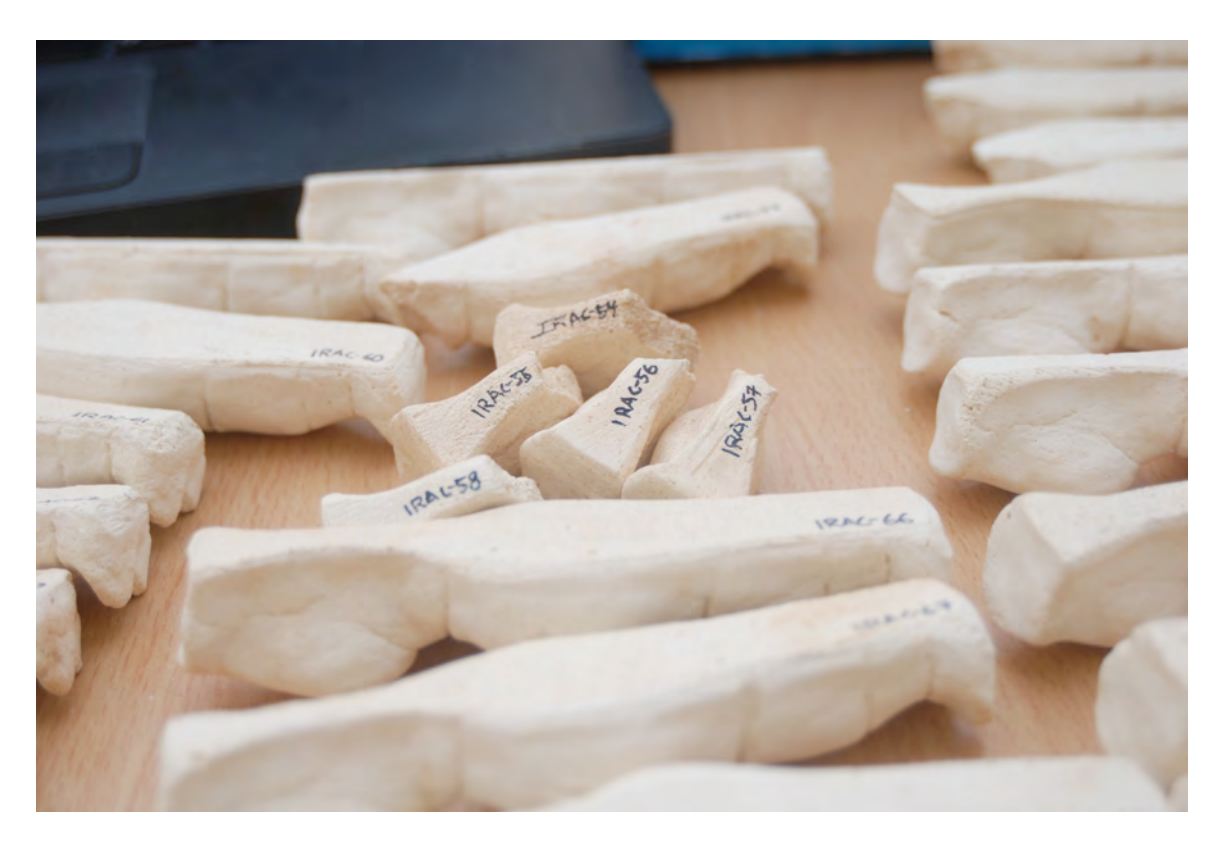
Production line from IRAC Interventions 2: Day of the Figurines, Theoretical Archaeology Group, York, England, 2007. <a href="http://www.iarchitectures.com/irac2.html">http://www.iarchitectures.com/irac2.html</a>