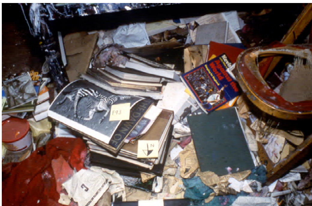
Figure 6 Layers of juxtaposed resource materials on the floor of the studio, with an archaeological feature number and north arrow.

As well as transformation , Edensor emphasises the effect of juxtaposition in questioning established categories of material so that new associations and images arise (Figure 6). He states that “in ruins the appearance of an apparently chaotic blend can affront sensibilities more used to things that are conventionally aesthetically regulated...the patterns of association which emerge out of the arbitrary combination of things strike peculiar chords of meaning and supposition, and impart unfamiliar aesthetic qualities...the ad hoc montages of objects...in ruins are not deliberately organized assemblies...but are fortuitous combinations which interrupt normative meanings...these happenstance montages comment ironically on the previously fixed meanings of their constituent objects...juxtapositions...have the effect of making the world look more peculiar than it did before” (ibid, 322-3).