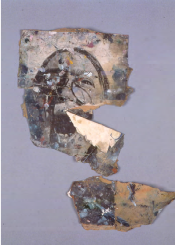
Figure 4 Film still of a screaming nurse from The Battleship Potemkin (1925) recovered from the studio.

“99 percent of the time I find that photographs are very much more interesting than either abstract or figurative painting. I’ve always been haunted by them.” (Bacon quoted in Sylvester 1993, 30)