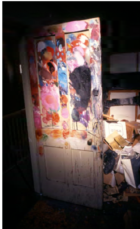
Figures 1 and 2 Views of the studio and its paint encrusted door.