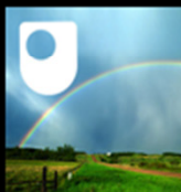
The Rainbow analysed