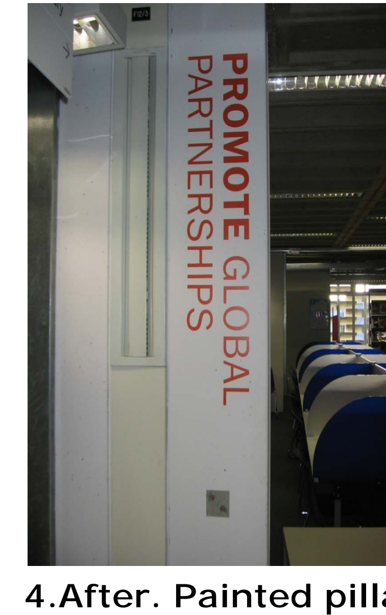
4.After. Painted pillar with MDGs graphics