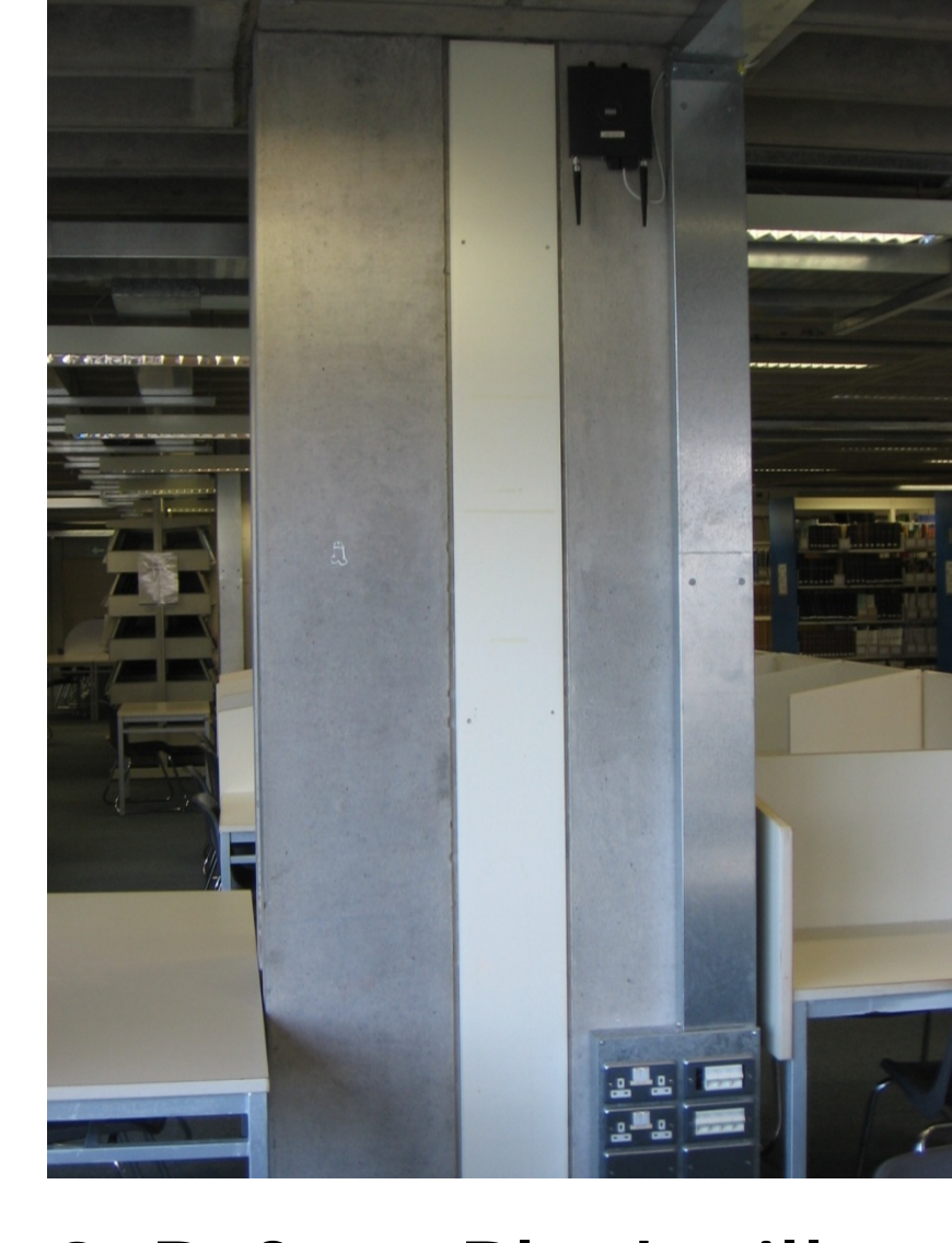
3. Before. Blank pillar