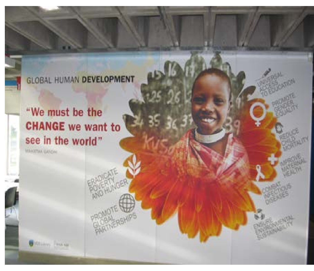
2. After. Themed wall panel