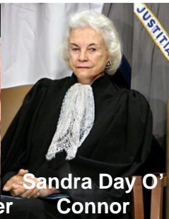
Sandra Day O'Connor