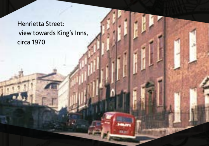
Henrietta Street: view towards King's Inns, circa 1970

The Data Seal of Approval Board, a European Commission recognised organisation, has designated UCD Digital Library as a Trusted Digital Repository. UCD Digital Library is the first repository in Ireland to be awarded the Data Seal of Approval, confirming that UCD Digital Library is recognised in the community as a trustworthy source of curated data.