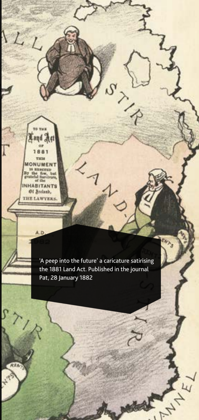
'A peep into the future' a caricature satirising the 1881 Land Act. Published in the journal Pat, 28 January 1882