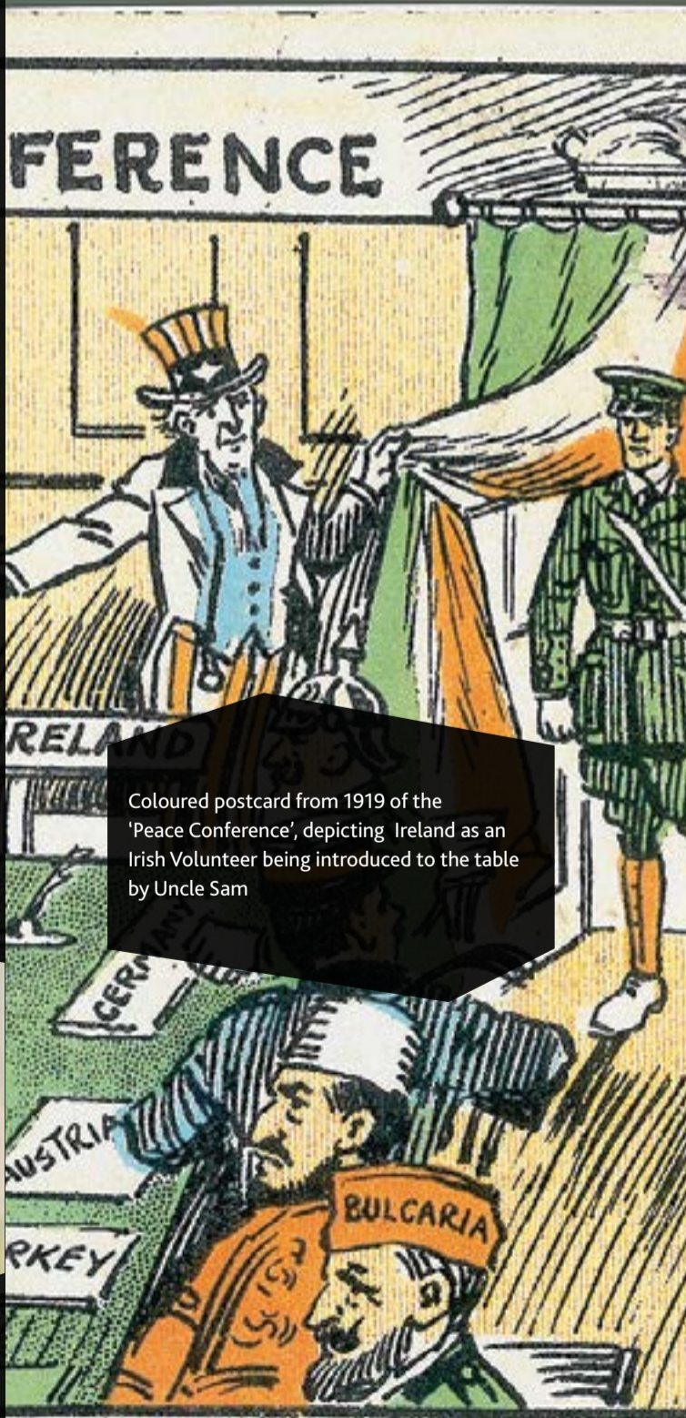
Coloured postcard from 1919 of the 'Peace Conference', depicting Ireland as an Irish Volunteer being introduced to the table by Uncle Sam