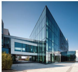
UCD Charles Institute

see the creation of Ireland's first academic institute focused on dermatology research and training. Research within the Charles Institute will address common skin disorders such as psoriasis, eczema, skin cancer and rare genetic skin diseases.