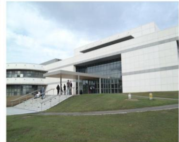
UCD Conway Institute