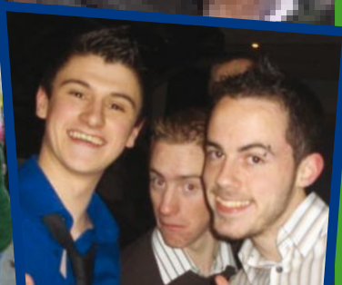
Enjoying the New ERA student Christmas Party