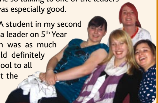
5 th Year Summer School students and leader

"I met a lot of new people and got to do many new activities. It was brilliant"