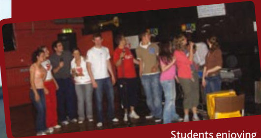
Students enjoying karaoke at Uni4U Summer School

90 2 nd Year secondary school students participated in the week long Uni4U Summer School programme. The week kicked off with some games and a campus tour giving the students the opportunity to get to know each other a bit better and meet their UCD New ERA student leaders. Taster talks in Law, Marketing, Psychology, Mathematics, Chemistry, Biology and Geography took place over the week and gave the students an idea of what kind of subjects you can study in UCD. A trip to Lyons farm was unfortunately hindered by the June rain but students still got an idea of the Veterinary Medicine and Agricultural Science programmes! Sports activities included archery and the climbing wall and Uni4U students finished the week off with a karaoke session!