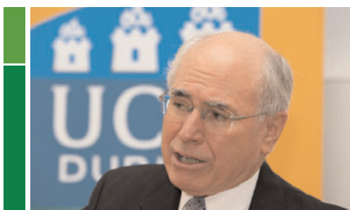
Australian Prime Minister John Howard on his visit to UCD

A donor cultivation programme has been established in Ireland and the USA to identify, cultivate and solicit donors for major gifts that will allow UCD to deliver on its strategic objectives.