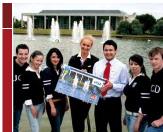
UCD affinity card launch

UCD Connections is the university's flagship annual publication to alumni and has a circulation of 120,000. The magazine represents the high end of quality publications from UCD.