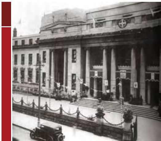
Earlsfort Terrace in an earlier era

The UCD Boat Club named a boat The Graduate in honour and appreciation of the graduates who donated to the UCD Boat Club Graduate Fund. The Boat Club, founded in 1917 and located in Islandbridge, is one of the oldest clubs in the university.