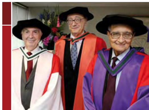
Pictured at the conferring of honorary degrees were (l to r): Milo O'Shea, Alfred Brendel and Professor Amartya Sen

Milo O'Shea was conferred an Honorary Doctor of Literature in recognition of his life's work on the stage and screen as one of Ireland's most successful actors. Born and raised in Dublin, his stage career has continued over seven decades. He performed with the Abbey Players, in the BBC sitcom Me Mammy and dozens of stage productions, television programmes and films, including the role of Leopold Bloom in Joseph Strick's 1967 film of Joyce's novel Ulysses .