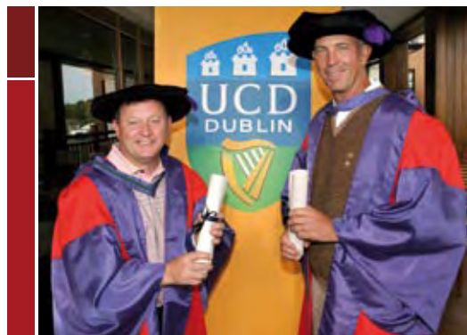
On the occasion of the 2006 Ryder Cup competition in Ireland, the captains of the teams from Europe and the United States, Ian Woosnam (left) and Tom Lehman, along with four other global figures in golf administration, were conferred with Honorary Doctor of Laws degrees in September 2006

Professor Amartya Sen was conferred an Honorary Doctor of Laws in recognition of his work on famine, human development theory, welfare economics, the underlying mechanisms of poverty and political liberalism. Born in India, his major contribution to late 20th century development economics has been the concept of 'capability'. He has won the Nobel Prize for Economics and his books have been translated into more than 30 languages.