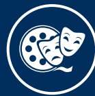
UCD School of English, Drama and Film