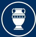
UCD School of Classics