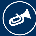
UCD School of Music