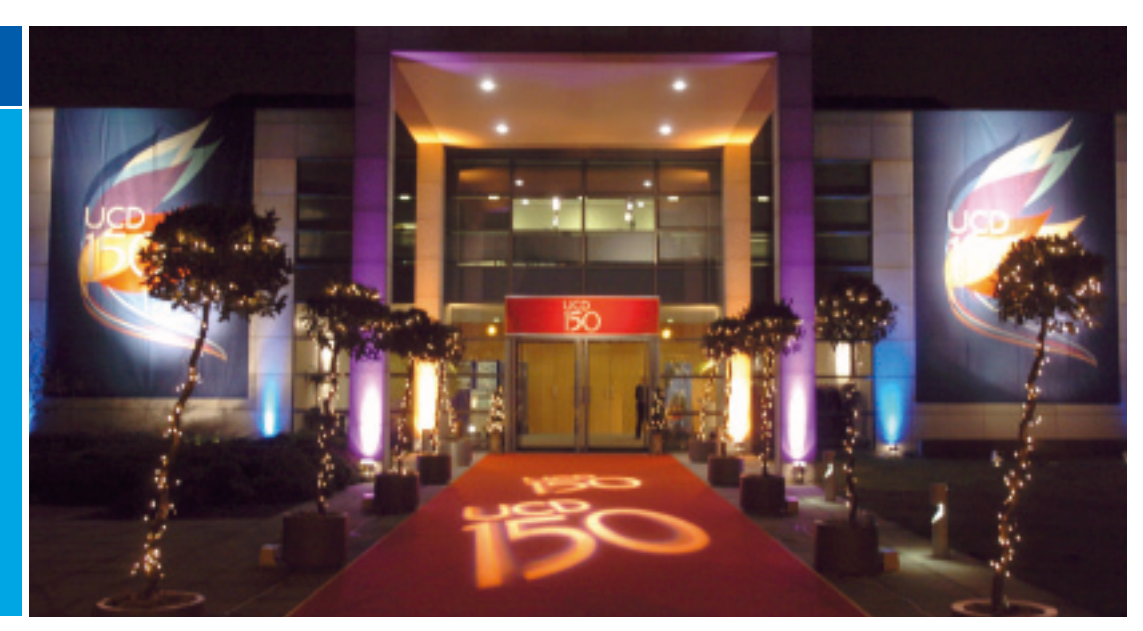
Entrance way to the UCD 150 Foundation Day Dinner held on 5 November '04