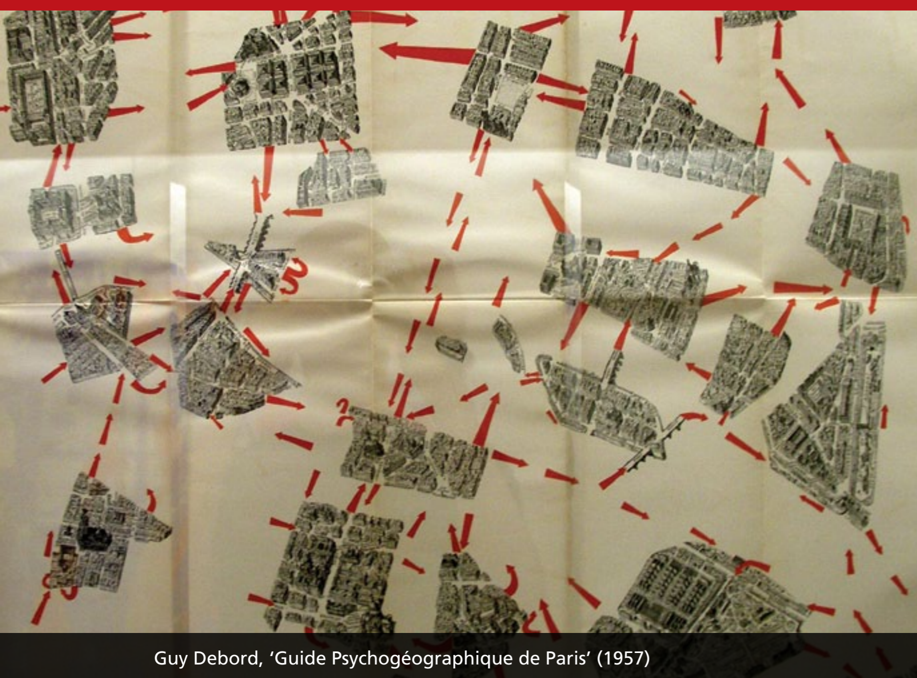
Guy Debord, 'Guide Psychogéographique de Paris' (1957)