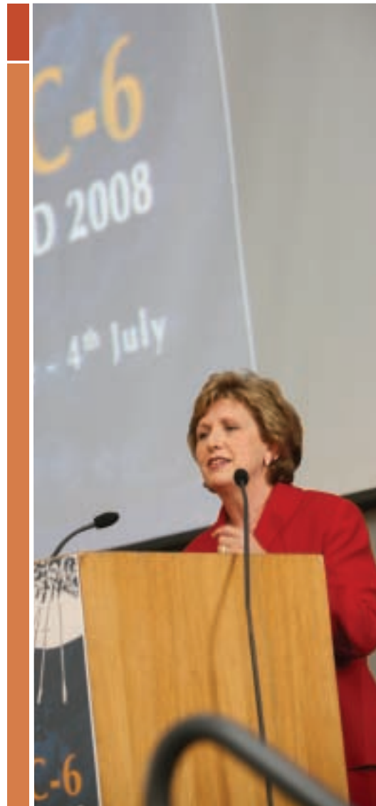
President Mary McAleese opening the World Archaeological Congress in O'Reilly Hall in July 2008