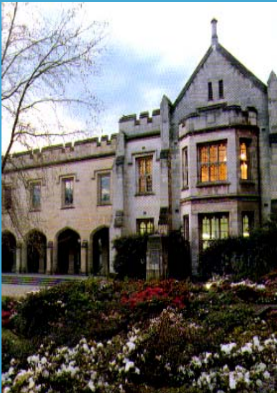
University of Melbourne