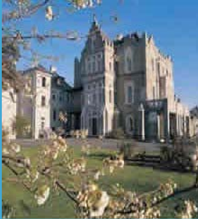
UCD School of Law Roebuck Castle