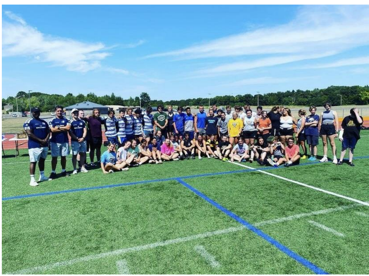
Page 9 of 11