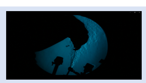
Figure 2: Raw Footage of Gas Leak recorded by Schlieren