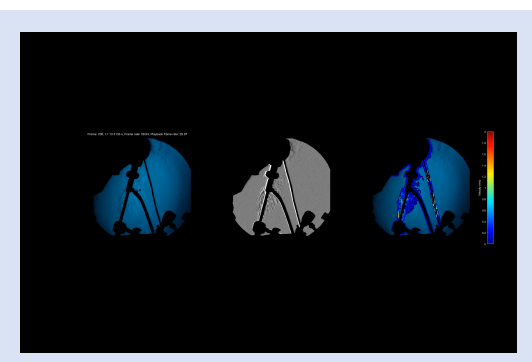
Figure 3: Video data showing a Cropping Issue