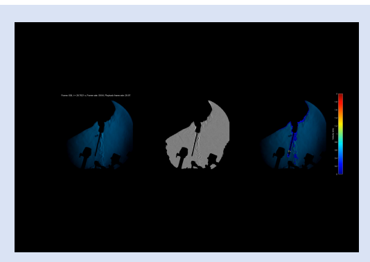
Figure 4: Video data showing a Masking Issue