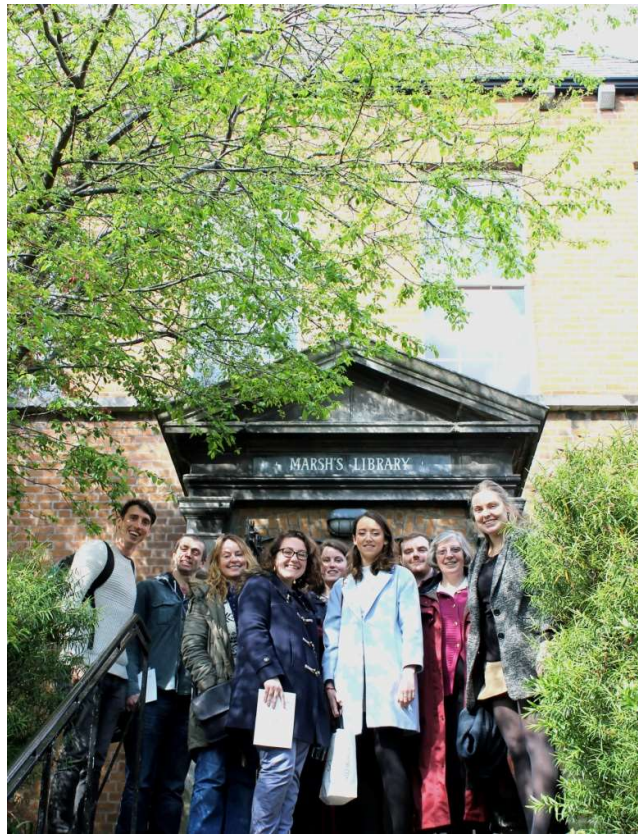
Students on a visit to Marsh's Library

The MA Archives and Records Management in the School of History is an exciting degree which qualifies students to manage a range of records and archives from medieval manuscripts to born digital records. The MA programme equips students with the skills to practically care for and provide access to the historic and future memory contained in records. It also provides students with a strong theoretical foundation in the discipline, underpinning their practical knowledge with an understanding of the ethical and legal role of the contemporary record keeper.