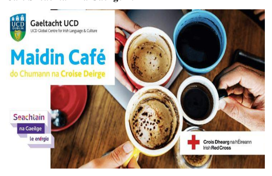
Café Sheachtain na Gaeilge 2022

In celebration of Seachtain na Gaeilge 2022-National Irish Language Week, Gaeltacht UCD organized an Irish language coffee morning with live music specifically for UCD faculty and staff. The event was held in the Contemplative Space, in the UCD Lochlann Quinn School of Business, and was attended by Irish language speakers and learners from the Belfield and Smurfit campuses. It served the purpose of reuniting Irish-speaking staff some of whom had been working remotely and/or limiting social contact during the previous year's health restrictions. It raised awareness of the Gaeltacht UCD 2022 services and attracted several staff new to UCD who could engage with the language on campus. The Centre looks forward to hosting similar on-campus events in the year ahead, events to facilitate language use in a relaxed, informal environment.