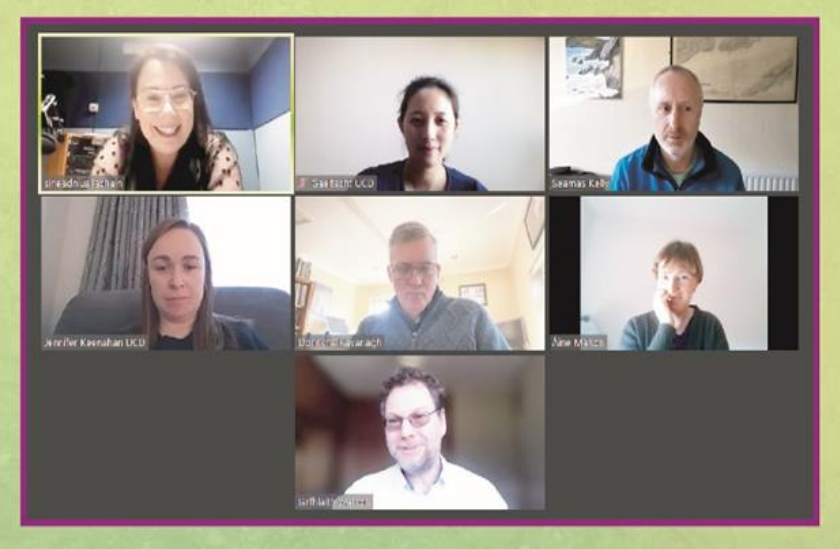
Some of the UCD faculty and staff who partook in the online radio broadcasting workshop facilitated by RTE Broadcaster Sinéád Ní Uallacháin