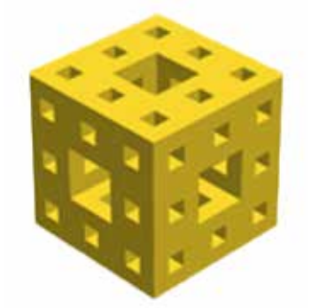
Figure 1: Diagram of the Menger Sponge

This process is repeated with the remaining cubes, leading to similar shape to that shown in figure 1. In doing so, the volume reduces and surface area increases each time. Given that this process can extend to infinity, Menger Sponge will thus have infinite surface area and zero volume.