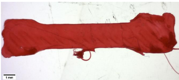
Figure 1: Microscope view for material fill validation