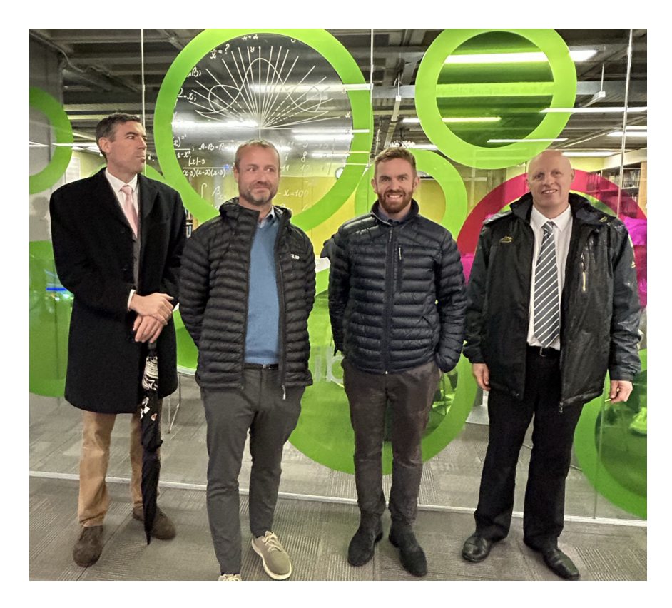
Figure 5: Mathematics teachers from Blackrock College at the MSC