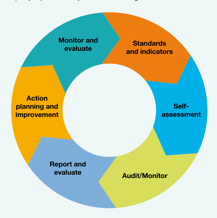
Figure 11: The Quality Improvement Cycle

The quality domains and corresponding standards and indicators need to be measured and reported to ensure ongoing quality improvements. This framework provides tools of support self-assessment, auditing, monitoring, to report and evaluate the quality of practice education from all stakeholders' perspectives. The quality improvement cycle is outlined in Figure 11