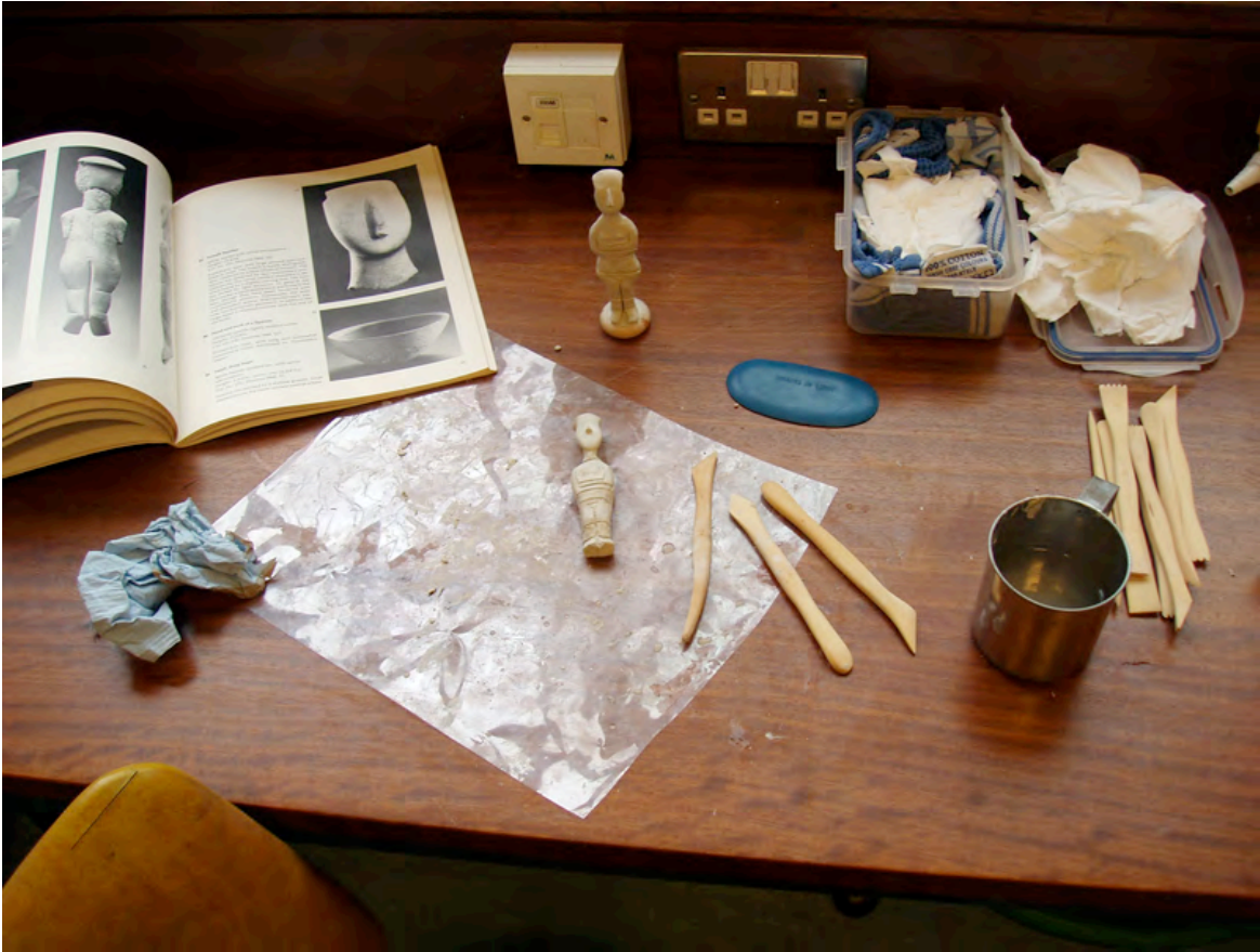
Research and development of a prototype for IRAC Interventions 2: Day of the Figurines, Theoretical Archaeology Group, York, England, 2007. < http://www.iarchitectures.com/irac2.html >