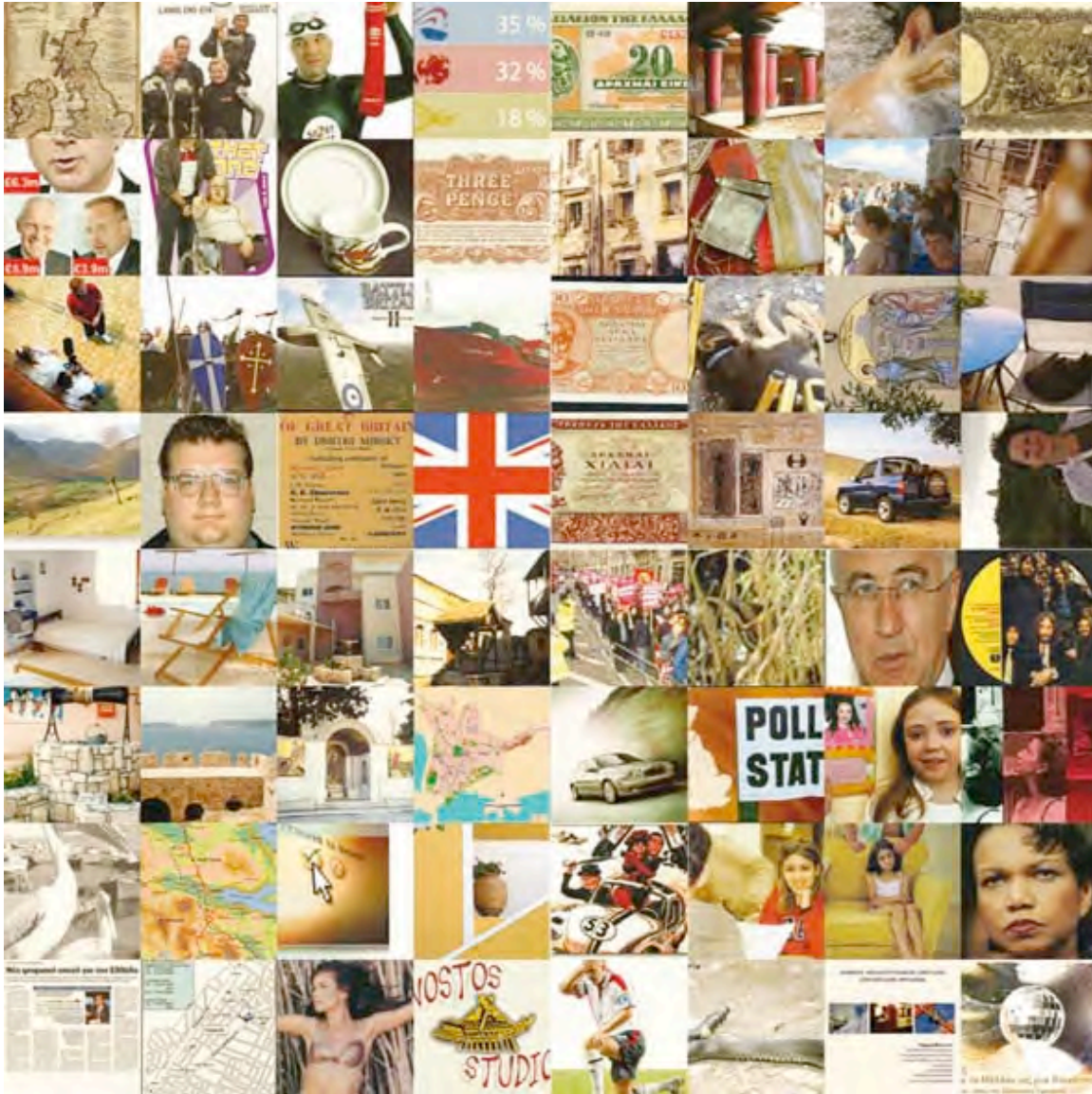
Detail of Reflexive Representations [1]. Each corner focuses on the images resulting from each search as follows: Upper Left - 'Britain' Bottom Left - 'Greece' Upper Right - 'Ellada' and 'Ellas' Bottom Right - 'βretania'. < http://www.iarchitectures.com/rrexhibit.html#rr1 >