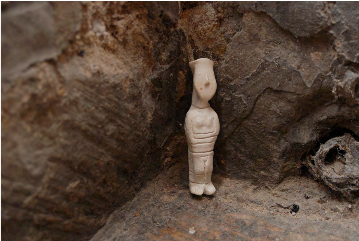
Documented deployment from IRAC Interventions 2: Day of the Figurines, Theoretical Archaeology Group, York, England, 2007. < http://www.iarchitectures.com/irac2.html >

Thus we call archaeologists to participate in active and dynamic methods of visual expression. We are not asserting the need for a Dadaist archaeology or a Futurist archaeology or a surrealist archaeology. What we call for is a re-engagement of