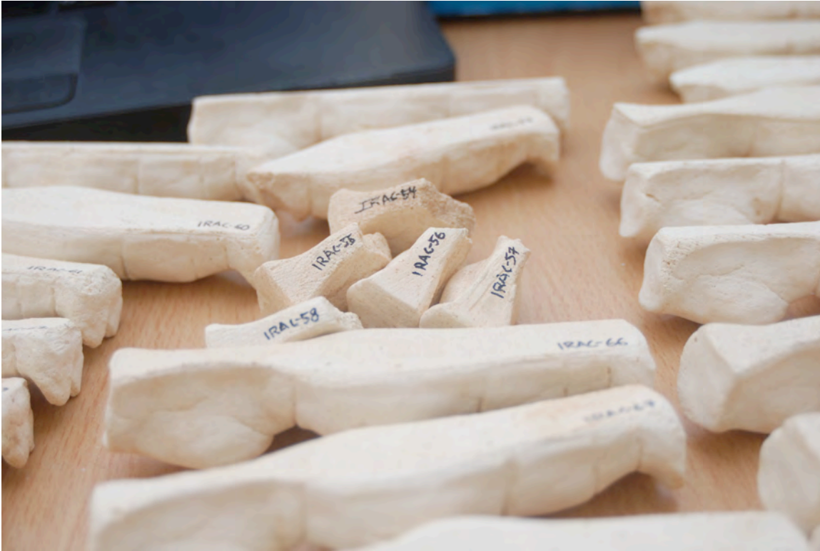
Production line from IRAC Interventions 2: Day of the Figurines, Theoretical Archaeology Group, York, England, 2007. < http://www.iarchitectures.com/irac2.html >