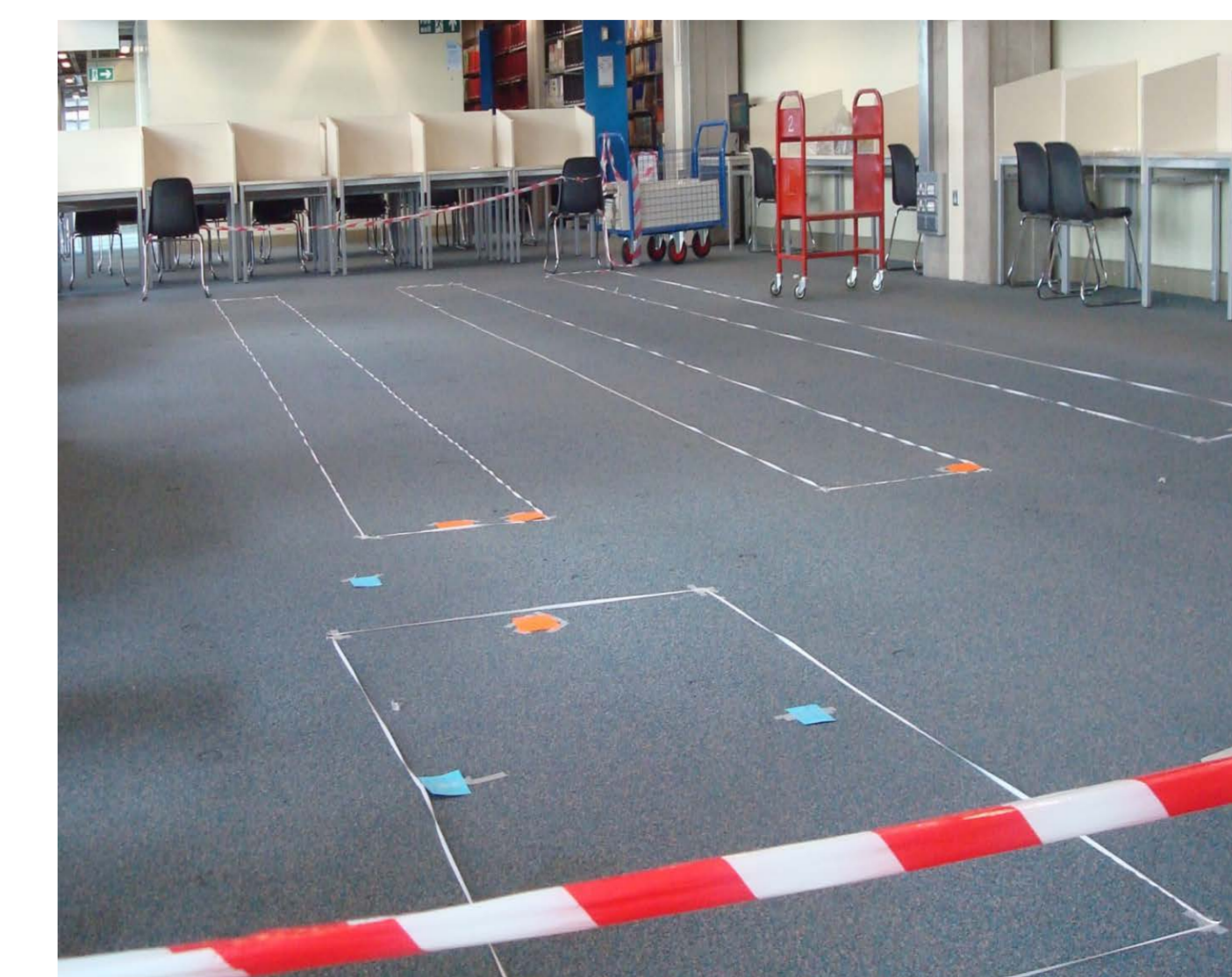
5.Before. Empty floor space with new design layout.