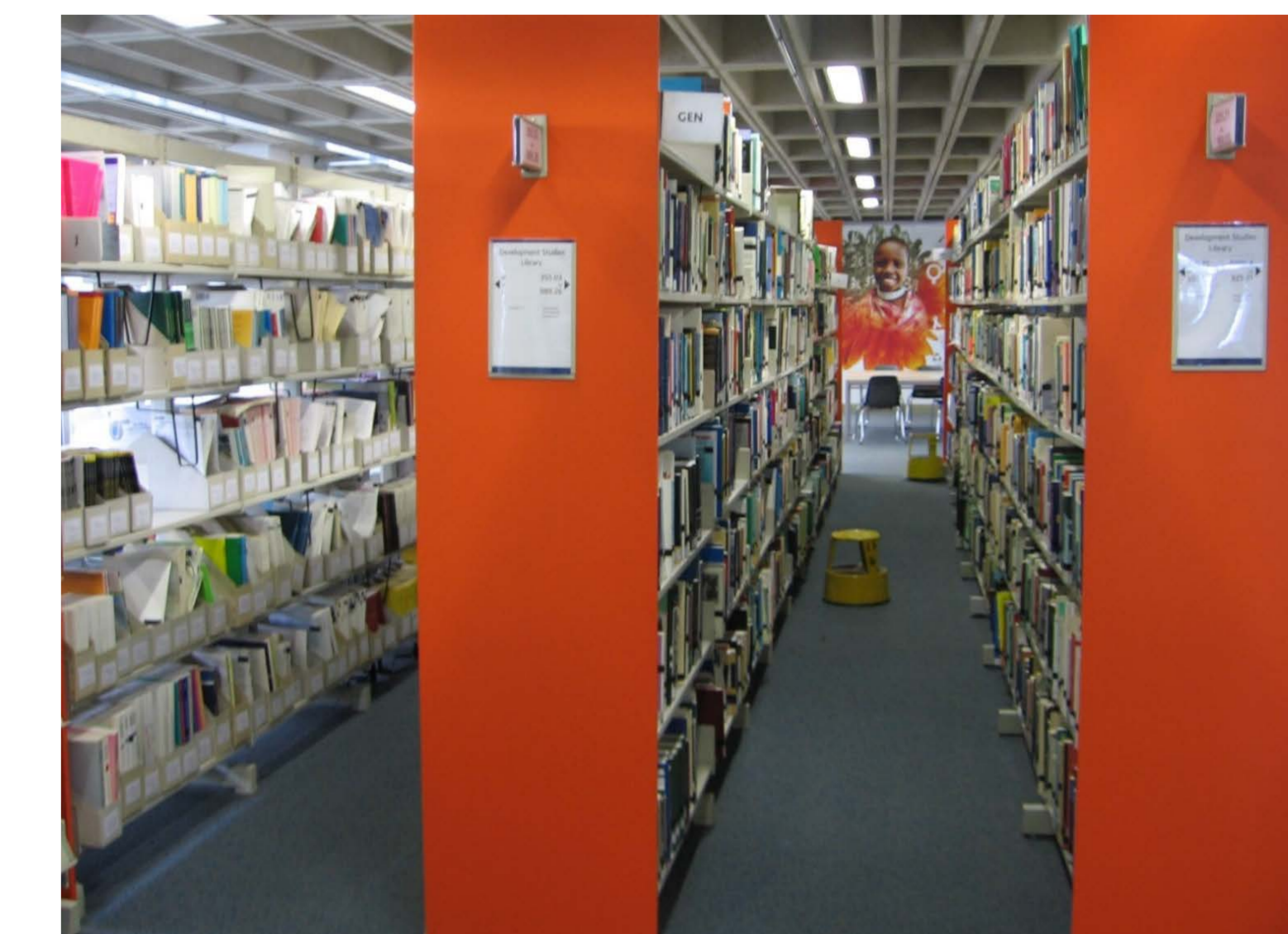
6. After. Completed new collection design layout with extra shelving .