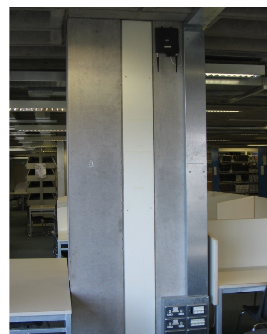
3. Before. Blank pillar