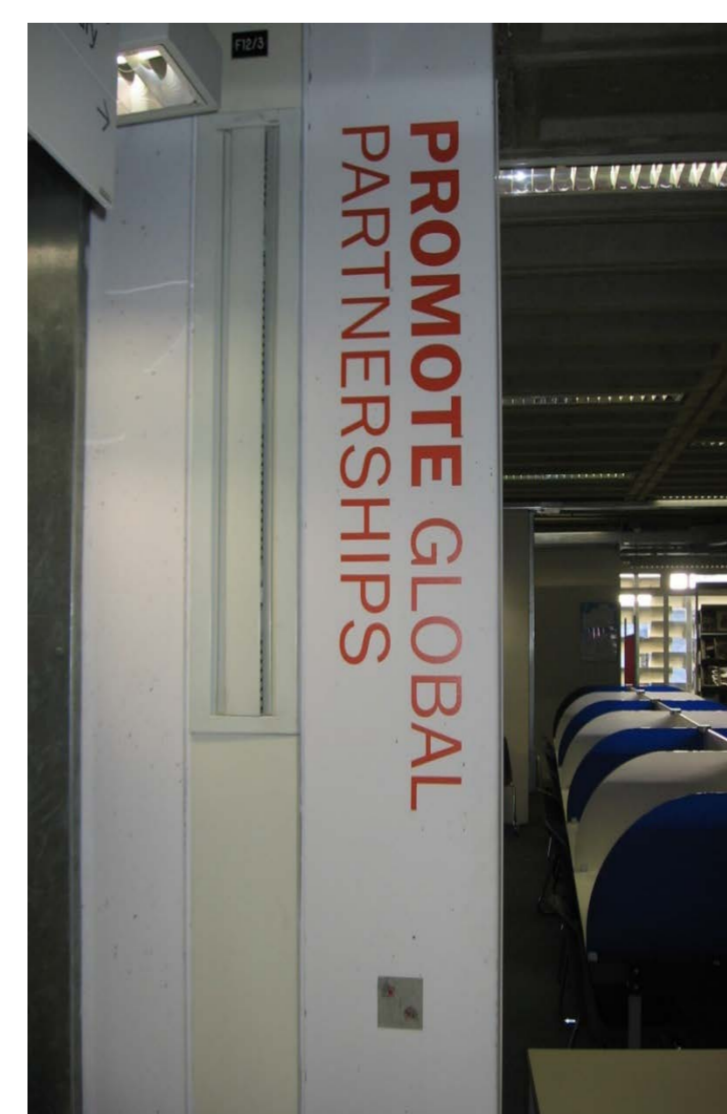
4.After. Painted pillar with MDGs graphics