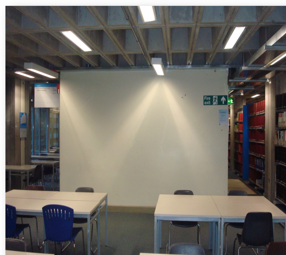
1. Before. Blank wall

Meeting Room available for group study, tutorials, open to all members of the development community.