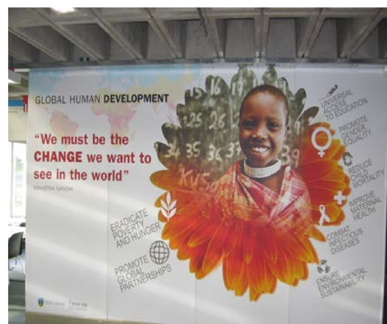
2. After. Themed wall panel