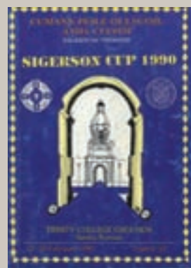
📷: Frontcover of the programme for the infamous 1990 Sigerson tournament held in Trinity. Courtesy of Dave Billings.