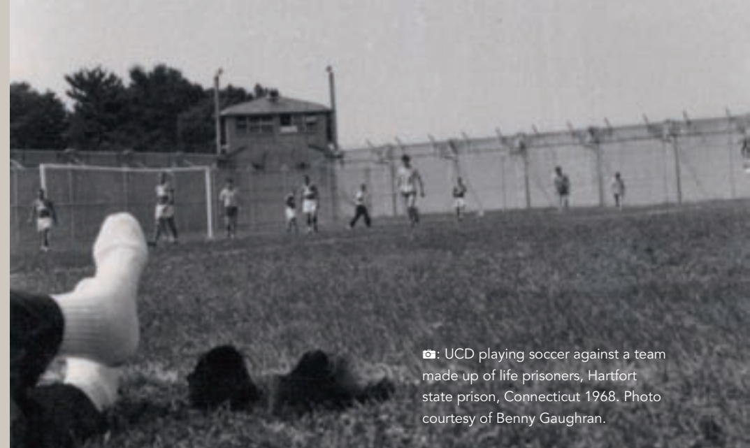
📷: UCD playing soccer against a team made up of life prisoners, Hartford state prison, Connecticut 1968.