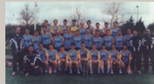
📷: 1996 Sigerson champions.