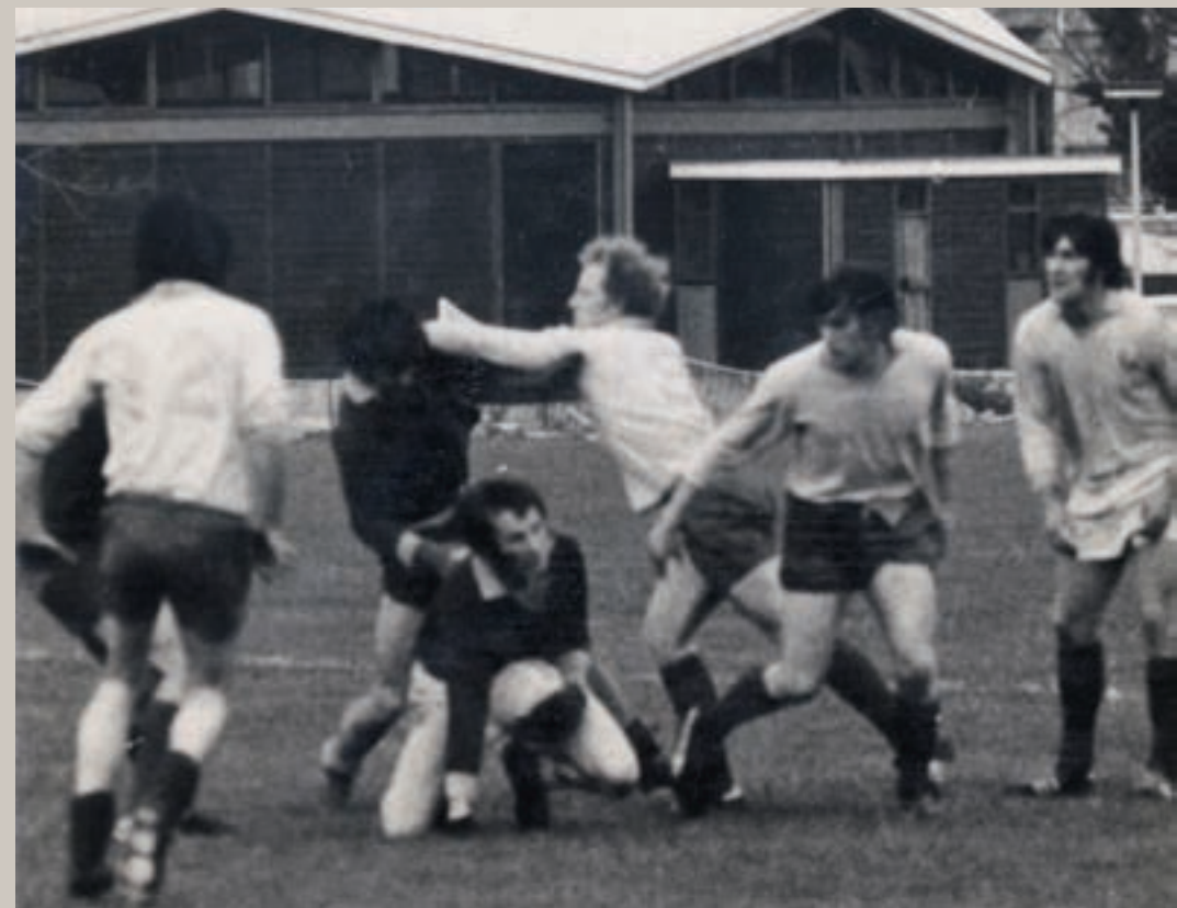
📷: UCD past players vs. UCD present players.

UCD was a very good platform for people whose counties weren't that