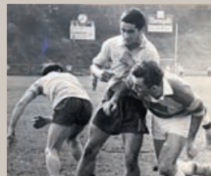
📷 above: UCD in action against New York in June 1968 in Gaelic Park as part of UCD's American tour.