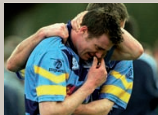
📷: Bitter taste of defeat following the 2001 final. Photo courtesy of Sportsfile.