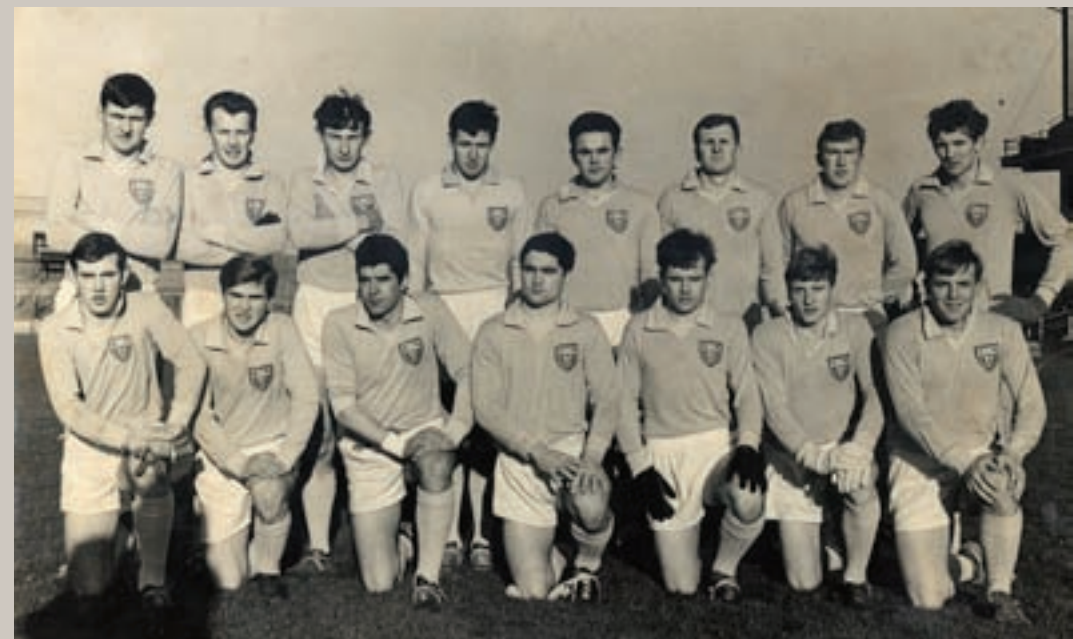
📷: 1968 Sigerson team.