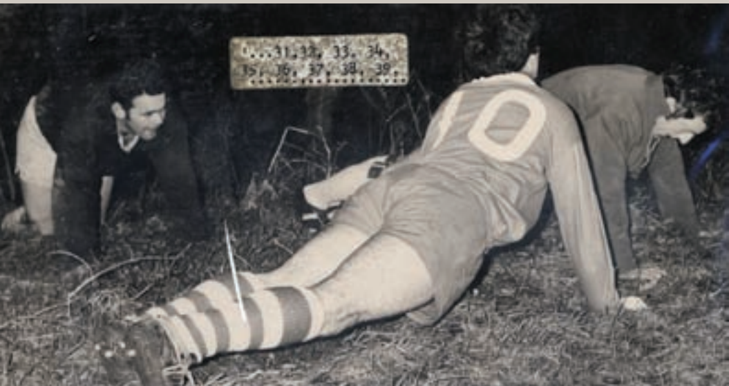
📷: Training in Belfield at 7am in the late 1960s.