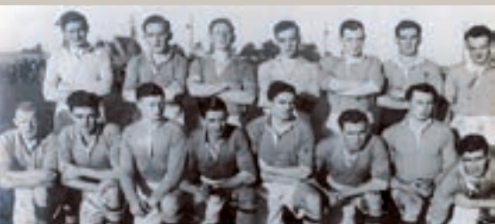
📷: 1945 Sigerson champions.