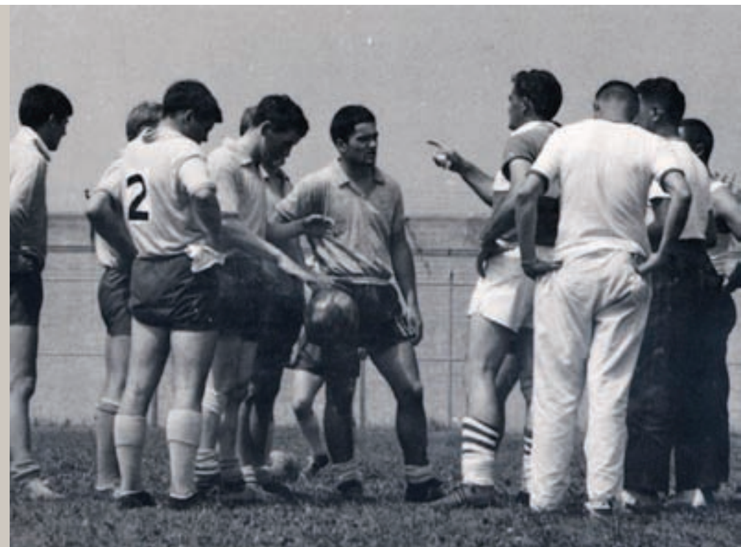
UCD team playing soccer against life prisoners at Hartford State Prison, Connecticut 1968.

In the Sigerson, players got stuck into one another on the park but there was great socialising between the teams afterwards, especially at the famous dinners. I even remember going back to Dublin from Belfast one time with the UCC bus such was the camaraderie between the teams. Recently I met up again with the 1967/68 Sigerson winning side in a reunion in Galway. The same great character and spirit was still in evidence amongst the team, which serves to demonstrate the incredible and enduring spirit of the Sigerson.