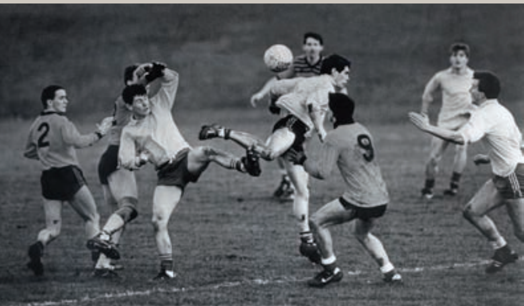
📷: UCD vs. Trinity in the 1990 Colours game. Courtesy of UCD Sportscentre.