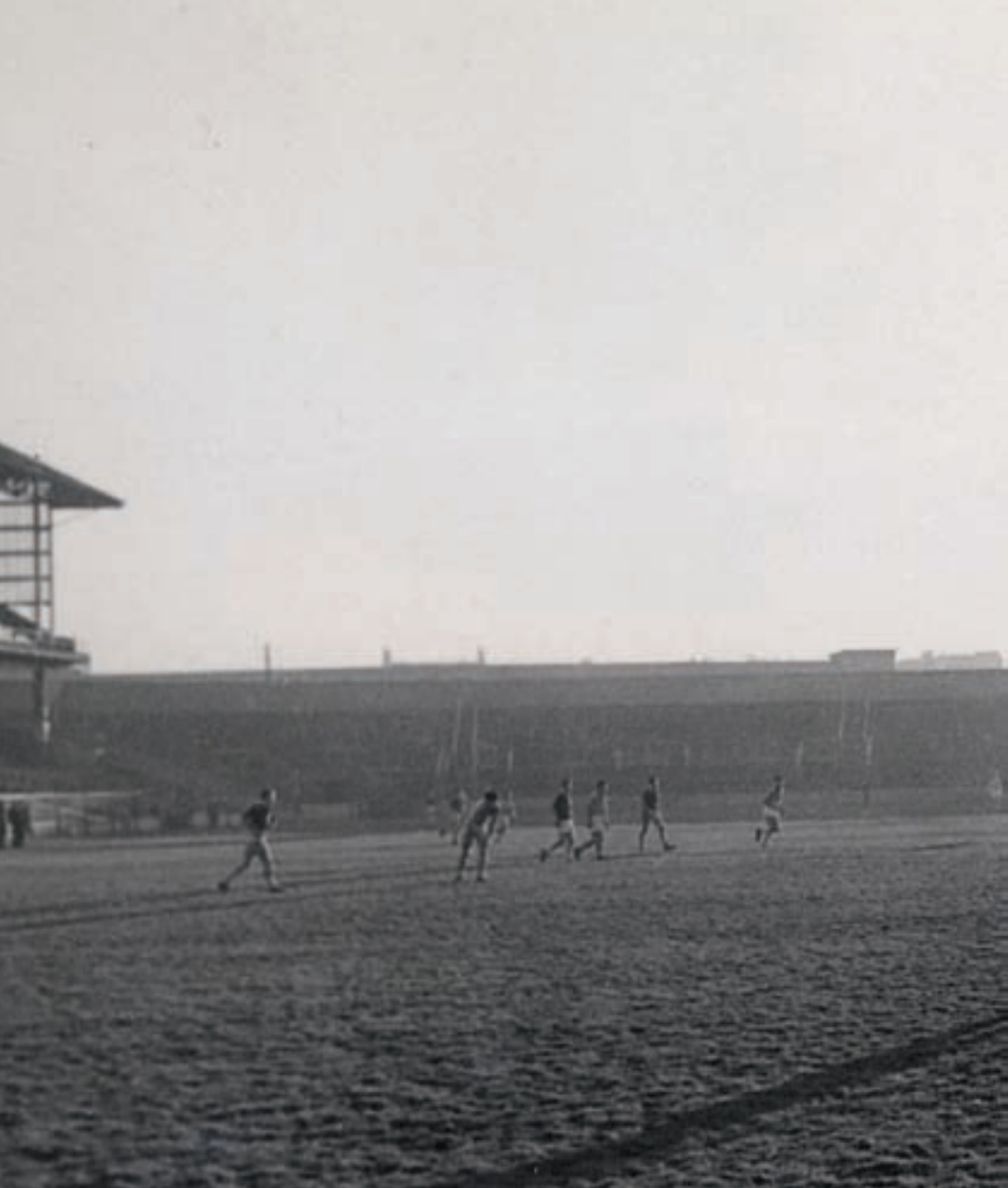
Last kick-out of the 1968 Sigerson final at Croke Park.