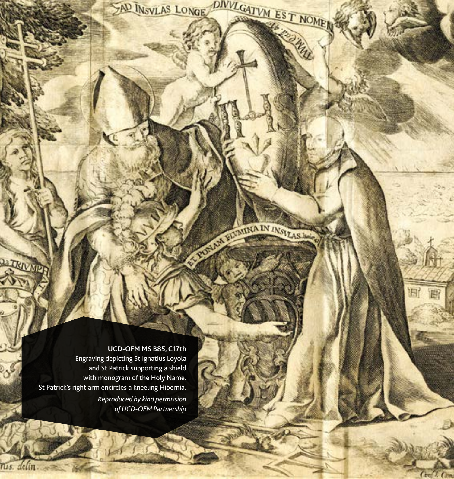
UCD-OFM MS B85, C17th Engraving depicting St Ignatius Loyola and St Patrick supporting a shield with monogram of the Holy Name. St Patrick's right arm encircles a kneeling Hibernia.