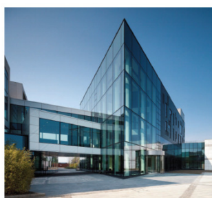
UCD Charles Institute

see the creation of Ireland's first academic institute focused on dermatology research and training. Research within the Charles Institute will address common skin disorders such as psoriasis, eczema, skin cancer and rare genetic skin diseases.