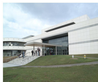
UCD Conway Institute