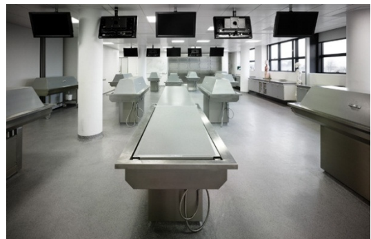
State-of-Art Anatomy Dissection Room