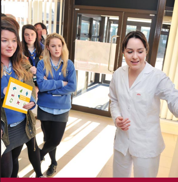
YOUR GUIDE TO CONTINUING PROFESSIONAL DEVELOPMENT