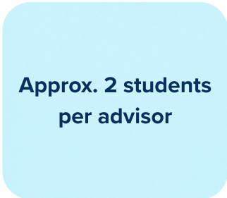
Student-to-Academic Advisor Ratio