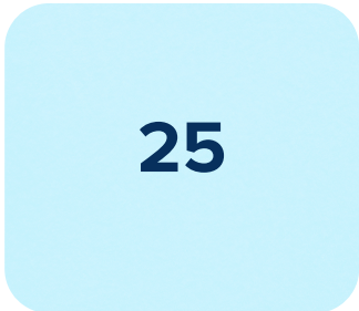
Stage 1 Students (cohort)