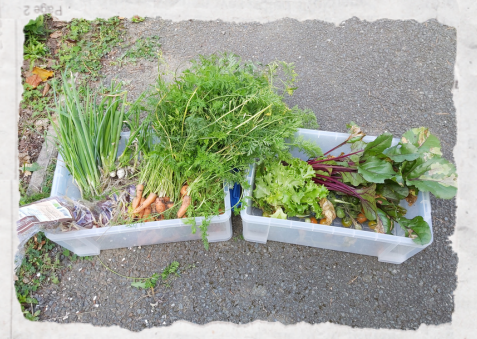
www.arvniter and Joint bookrunner